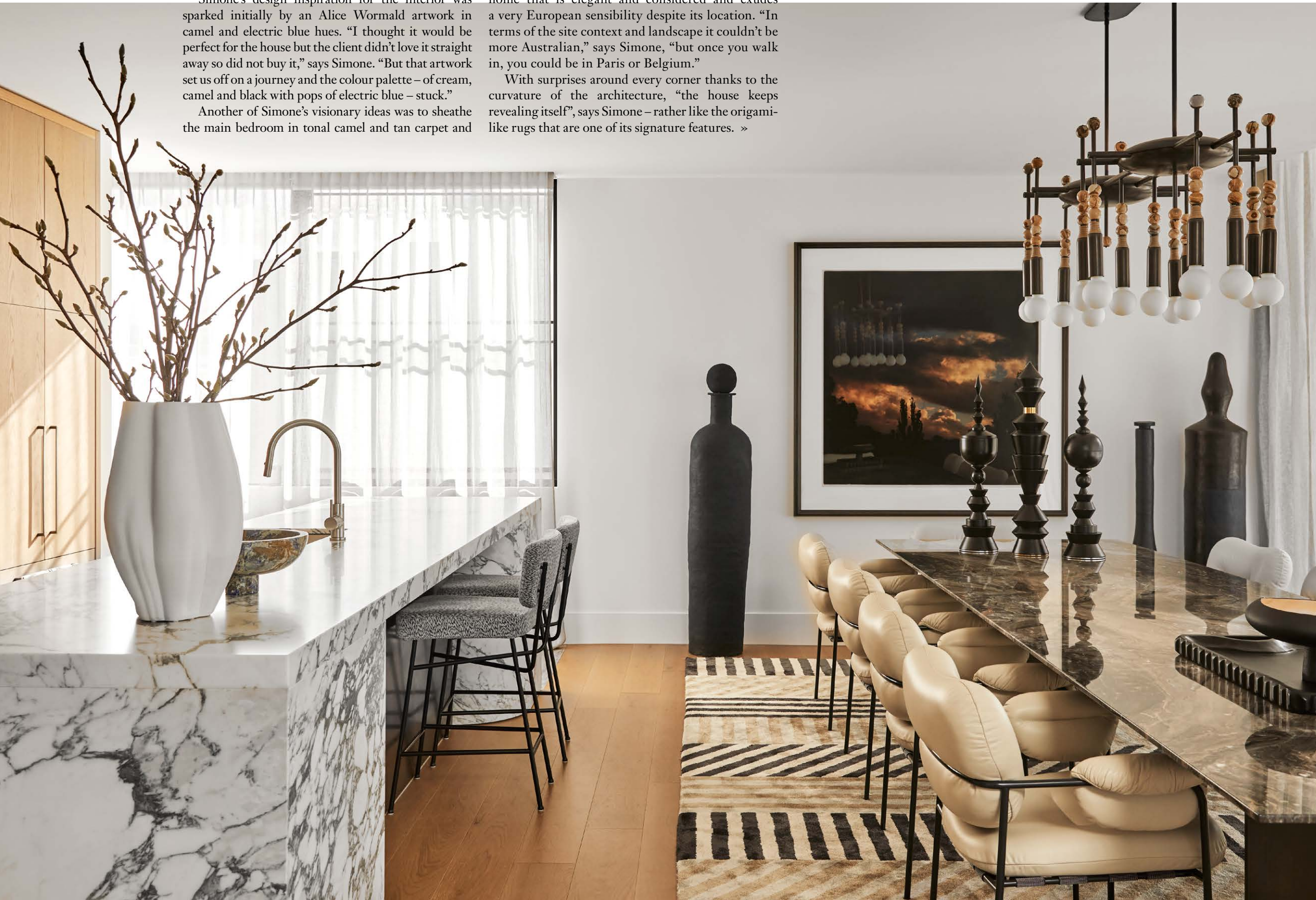
These pages, clockwise from left Minotti 'Linha' dining table from De De Ce with Foggia 'Spisolini' chairs from Fred International. Apparatus 'Talisman 14' pendant light from Criteria. 'Paris Opera' series print by Bill Henson. Custom rug by Simone Haag. On table, a trio of Zlata Kornilova sculptures from Garde at one end and an Arteriors tray from Boyd Blue. Other sculptures and objects from the clients' collection. Arflex 'Orfeo' bar stools from Space. Kitchen design by Flack Studio with Arabescato marble and custom Boffi tapware. The master bedroom lobby was designed by Simone to make a statement. Artwork by Galia Gluckman against the Nobilis 'Sisal' wallpaper from Redelman Fabrics. 'Combo' rug from Hommés Studio. Alison Frith ceramic plinths from Marz Designs.

With surprises around every corner thanks to the curvature of the architecture, "the house keeps revealing itself", says Simone – rather like the origami-like rugs that are one of its signature features. »