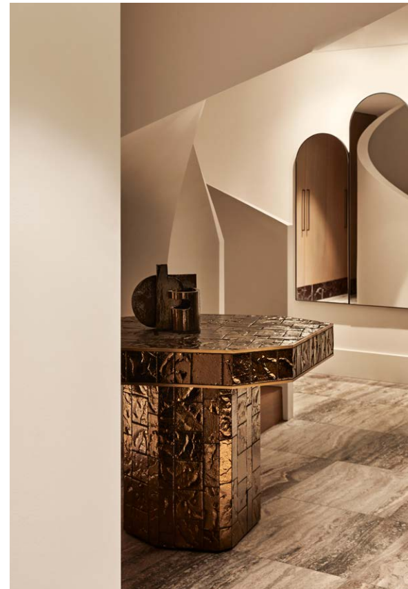
This page The colour palette of cream, camel and black with pops of electric blue is continued throughout the house. The sofa is a Patricia Urquiola for Moroso design that the clients already owned. 'Sequoia' sheepskin poufs from Great Dane. 'Chain' carved stool from Jayson Home. 'Koishi' coffee table from Poliform. Inès Bressand 'Lebone' floor lamp from Studio ALM. Le Berre Vevaud 'Barth Stool Les Intemporels Blue' from The Invisible Collection. B&B Italia 'Jack' shelving system from Space. Custom contoured rug from Whitecliffe Imports. On coffee table: black ceramic (left) by Caro Pattle and ceramic by Angela Hayes. Opposite page, clockwise from top left In the study, a Sammode Studio 'G25' wall light arcs across a custom desk and shelving by Lost Profile Studio and a Herman Miller 'Eames' executive chair from Living Edge. Harbro custom chair upholstered in Pollack 'Current' fabric in Bronze Age. Art is by Lorraine Kabbindi White. Ceramic is by Alexandra Standen from This is No Fantasy. In the basement lobby is a custom 'Strella' table clad in bronze ceramic tiles by Simone Haag for Studio Brand. AYTM 'Arcus' mirror from Design Stuff. Behind the sofa is a print by John Olsen and a 'Fool Moon' wall light from Ke-Zu. Sofa cushions in fabrics by Harbro in Métaphores 'Olympie' in Dune and de Le Cuona 'Spitfire' in Canyon. Ceramics behind sofa from Lawson-Fenning.