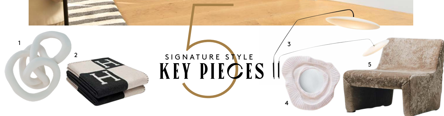
1 Dance of Bliss XVI sculpture by Greg Penn, $1600, from Otomys. 2 'Avalon' wool and cashmere throw in Écru/Gris Foncé, $2490, from Hermès. 3 Eden 'Fool Moon' wall lamp , POA, from Ke-Zu. 4 'Argonaute' ceramic mirror by Vincent Vauban, $1795, from Tigmi Trading. 5 'Reeno' occasional chair , POA, from Grazia&Co.

This page, clockwise from top left Travertine tiles line the floor in the bathroom with vanity and walls swathed in Arabescato marble. Custom Boffi tapware. Linde Freya Tangelder 'Windows of Bo Bardi - Butter' stool from Criteria and towels from Ondene. Ceramics from the client's collection. In the guest bedroom, is a 'Scrunch' table lamp from CB2 on an 'Amara' round-leg bedside table from GlobeWest. Mountain Study - Pink Sky print by Carla Hananiah from Edwina Corlette Gallery. Bedlinen from Sheet Society. Opposite page Arflex 'Alba' shelving from Space with ceramics by Jane McKenzie, Artemest, Ignem Terrae and from the client's collection. Plant from The Plant Society. Fogia 'Spisolini' chair from Fred International on a custom rug by Simone Haag.