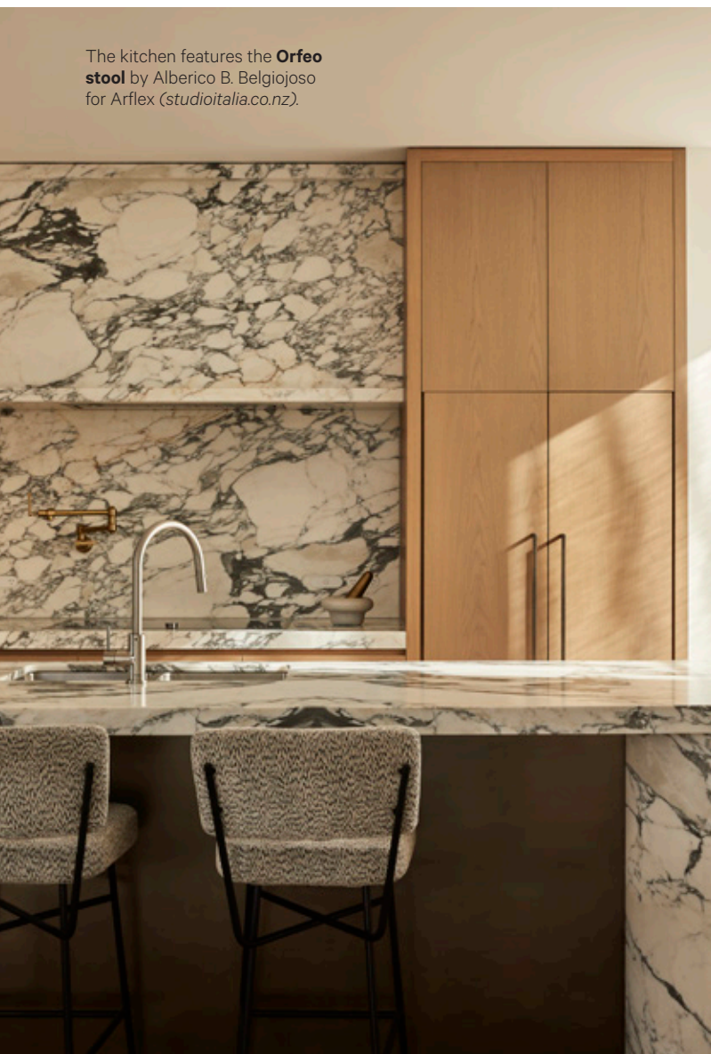
The kitchen features the Orfeo stool by Alberico B. Belgiojoso for Arflex ( studioitalia.co.nz ).