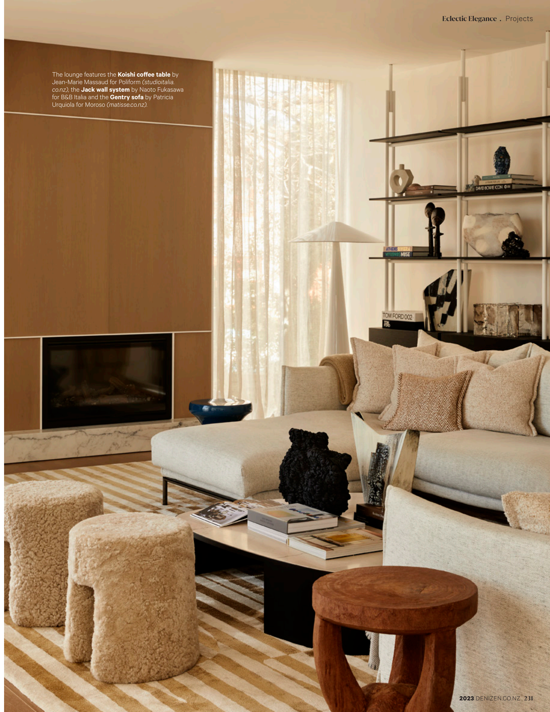
The lounge features the Koishi coffee table by Jean-Marie Massaud for Poliform ( studioitalia.co.nz ), the Jack wall system by Naoto Fukasawa for B&B Italia and the Gentry sofa by Patricia Urquiola for Moroso ( matisse.co.nz ).