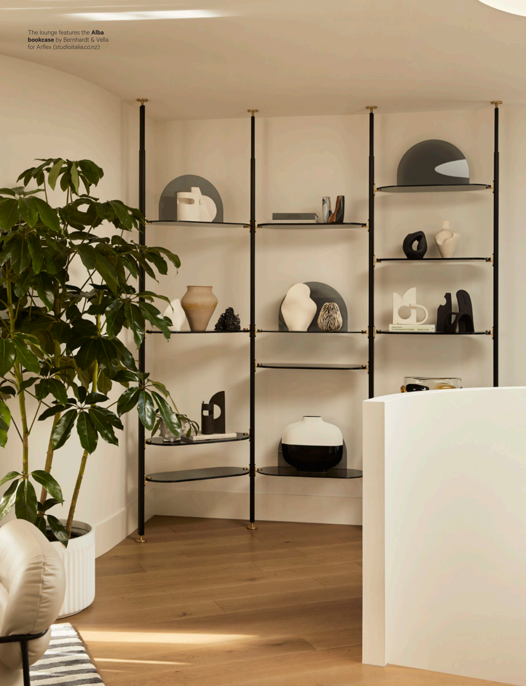
The lounge features the Alba bookcase by Bernhardt & Vella for Arflex ( studioitalia.co.nz ).